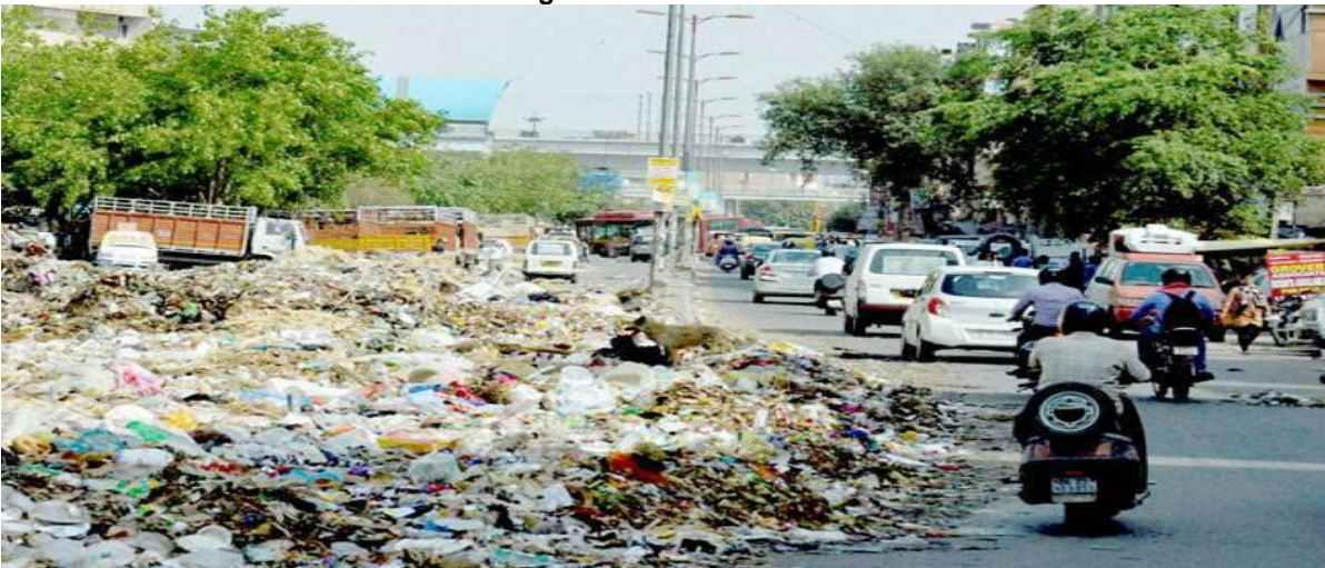
Picture4: Showing Solid Waste Management in Unscientific Way